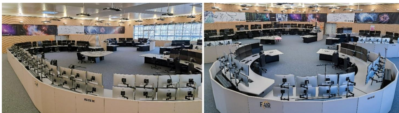
Figure 2: Photographs of the Main Control Room (MCR) taken on 9 March 2026 after completion of the test run. The left image shows the large console island in the foreground and the west-side window in the background. Banners are temporarily installed in the wall panel openings designated for the future installation of LED overview displays.

new main control room. Starting 26 February 2026, the beam operation in CRYRING [10] was fully controlled from the MCR. Operators working 24/7 shifts, together with machine and controls experts, used five operational consoles to manage access to the machine areas, set up beams, conduct machine studies, and perform extensive testing of new control software [11]. The test run was successfully completed on 9 March 2026. The Fig. 2 shows the MCR at the end of the test run. This intermediate milestone ensures that the MCR will be fully operational by summer 2026. The tendering process for the LED overview displays, to be installed on three walls of the MCR, is at an advanced stage.